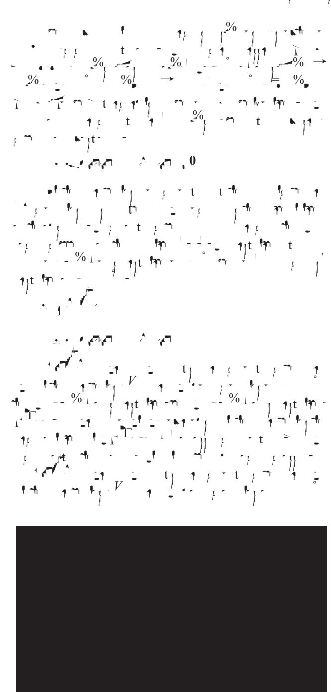
Fig. 6 Pitting potential of the steels in 3.5% NaCl solutions